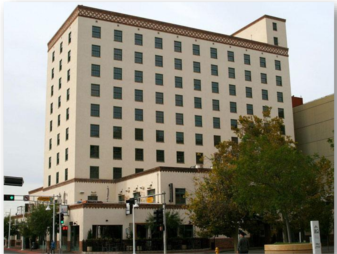
1939, Hotel Andaluz (Hilton Hotel), Albuquerque