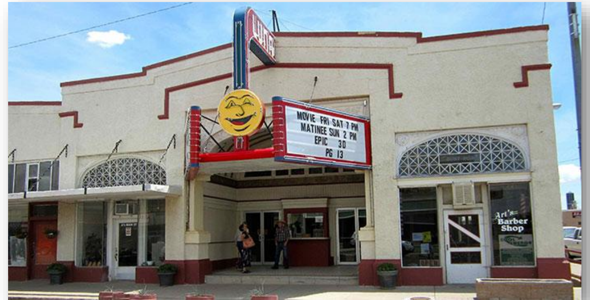
1916, Luna (Mission) Theater, Clayton