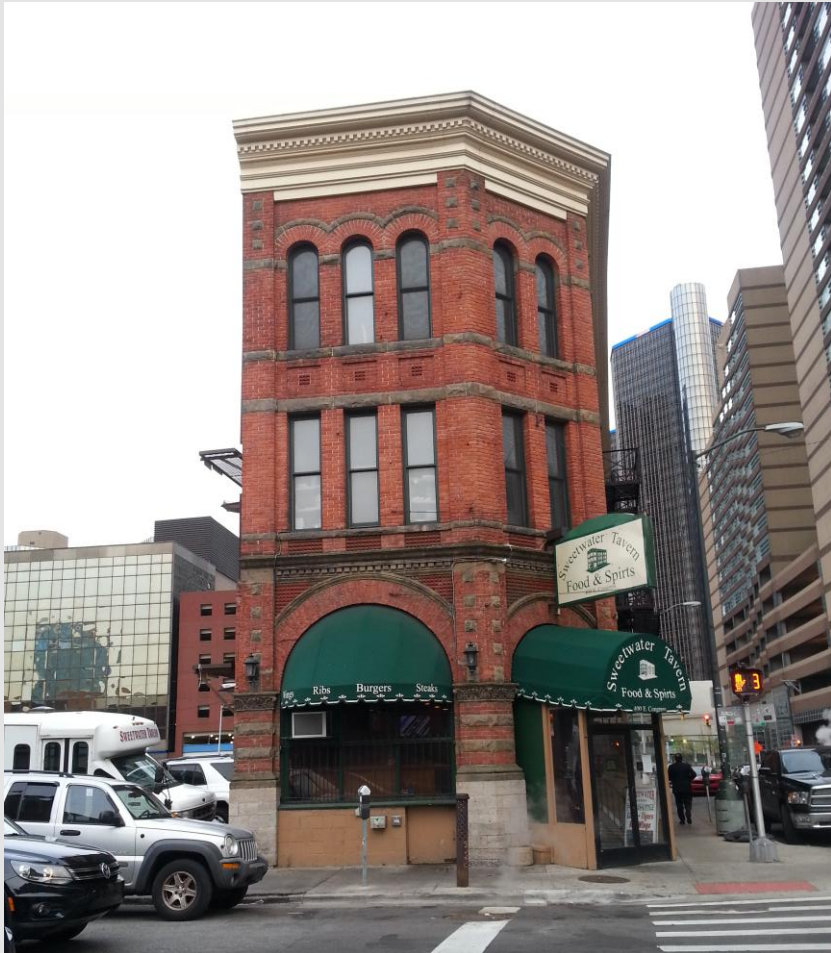
Downtown Detroit, MI

“Historic preservation is a conversation with our past about our future.