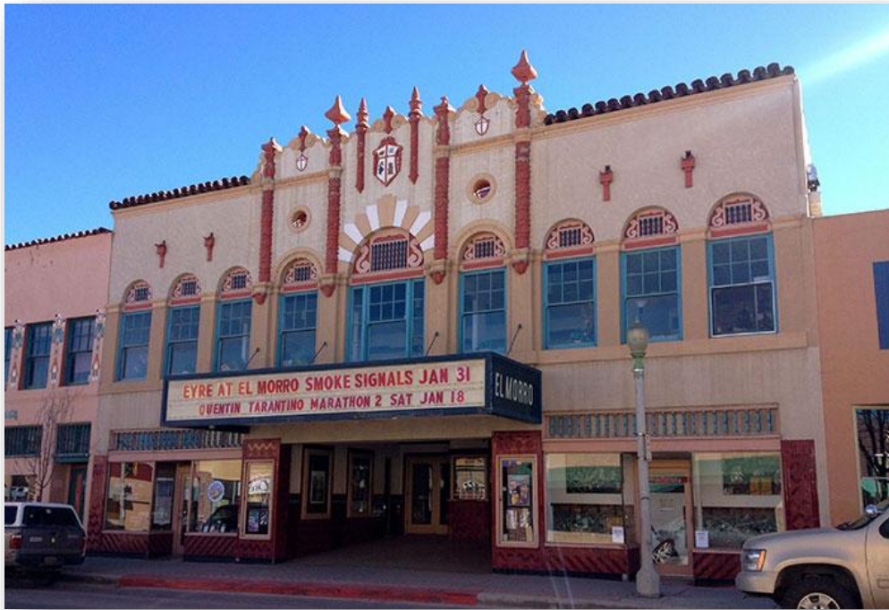
1928, El Morro Theater, Gallup