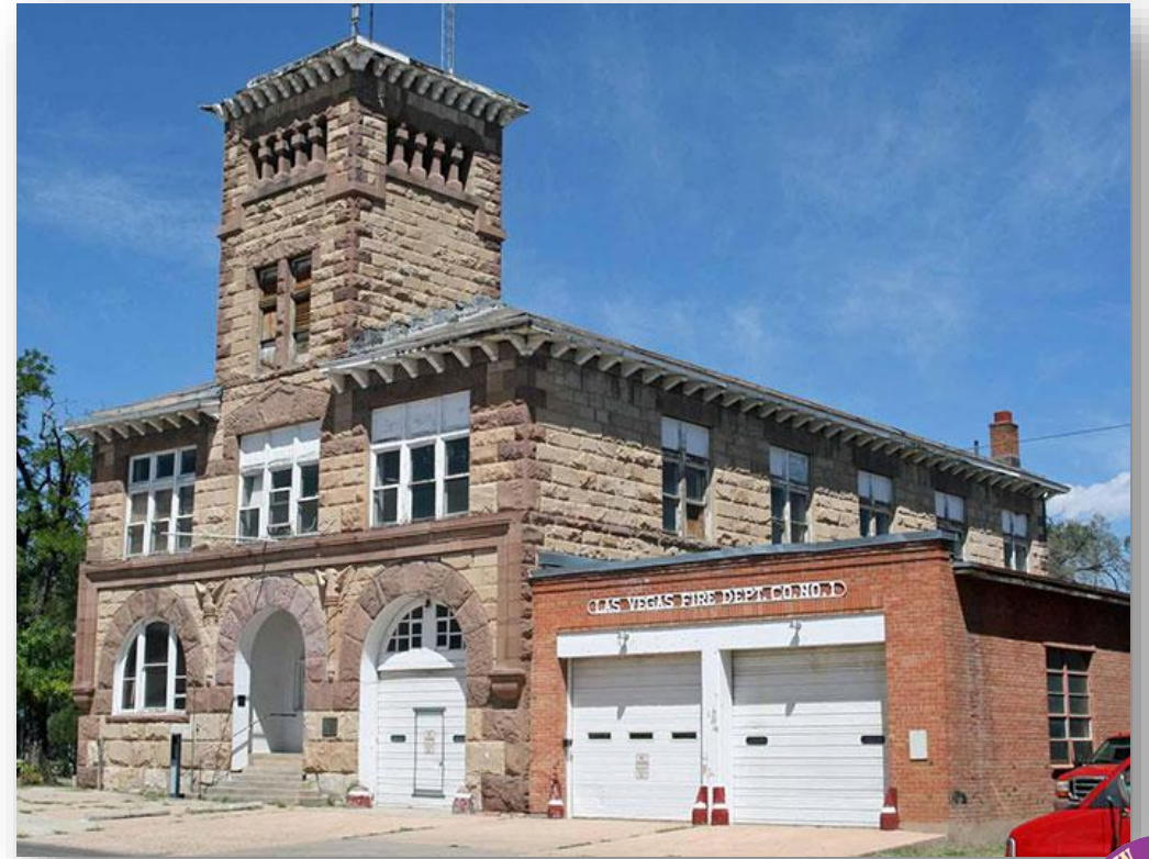
1882, Old City Hall Las Vegas