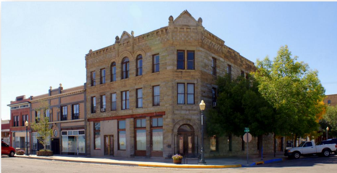
1896, Palace Hotel, Raton

Richardsonian Romanesque, popular SW 1885-90