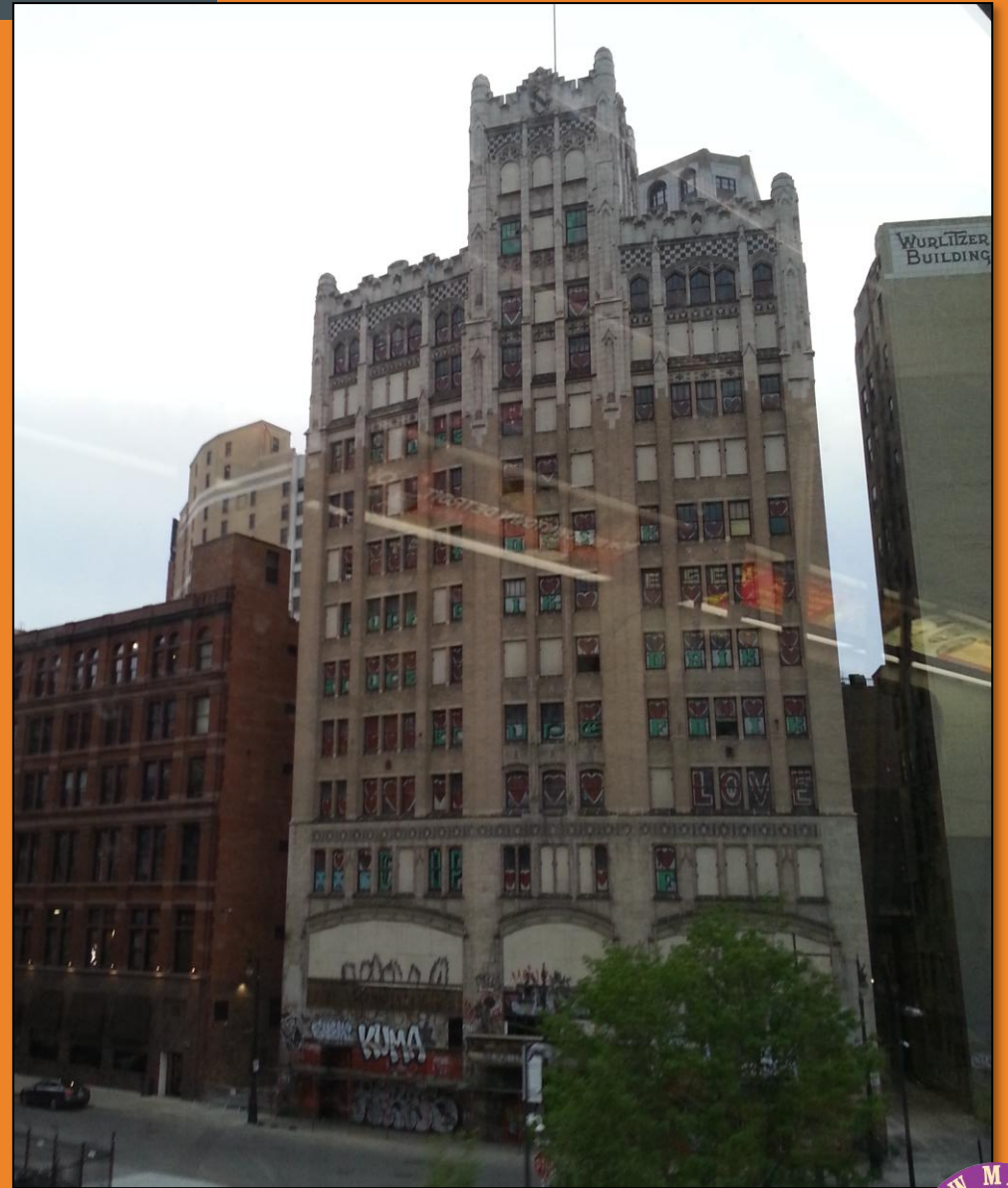
Downtown Detroit, MI