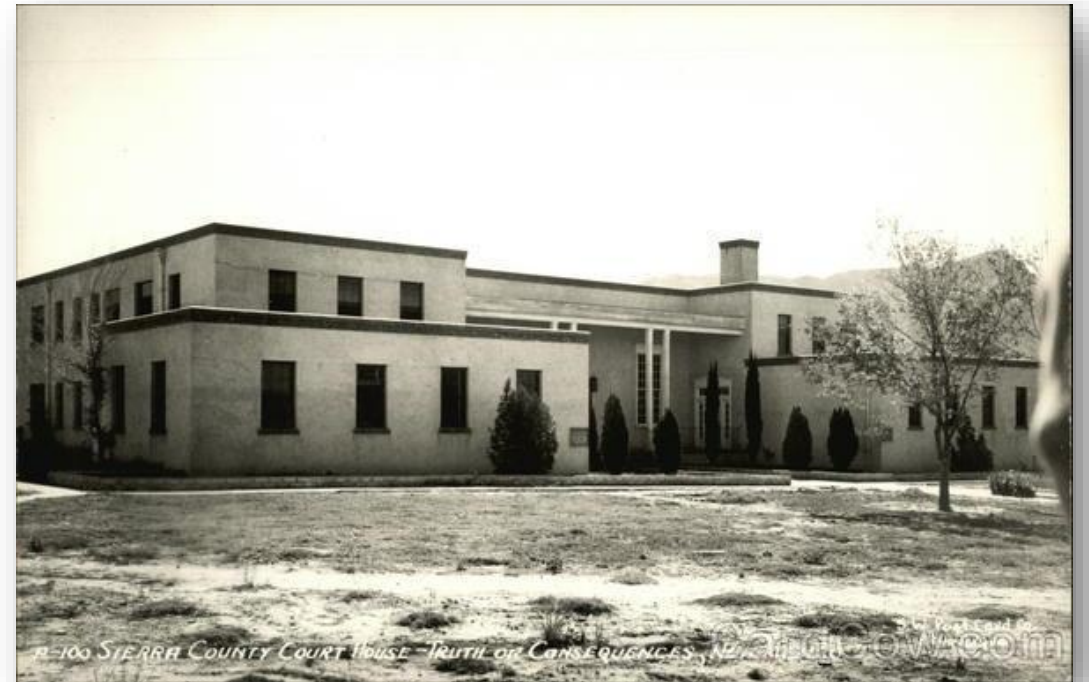
1938, Sierra County Courthouse, T or C