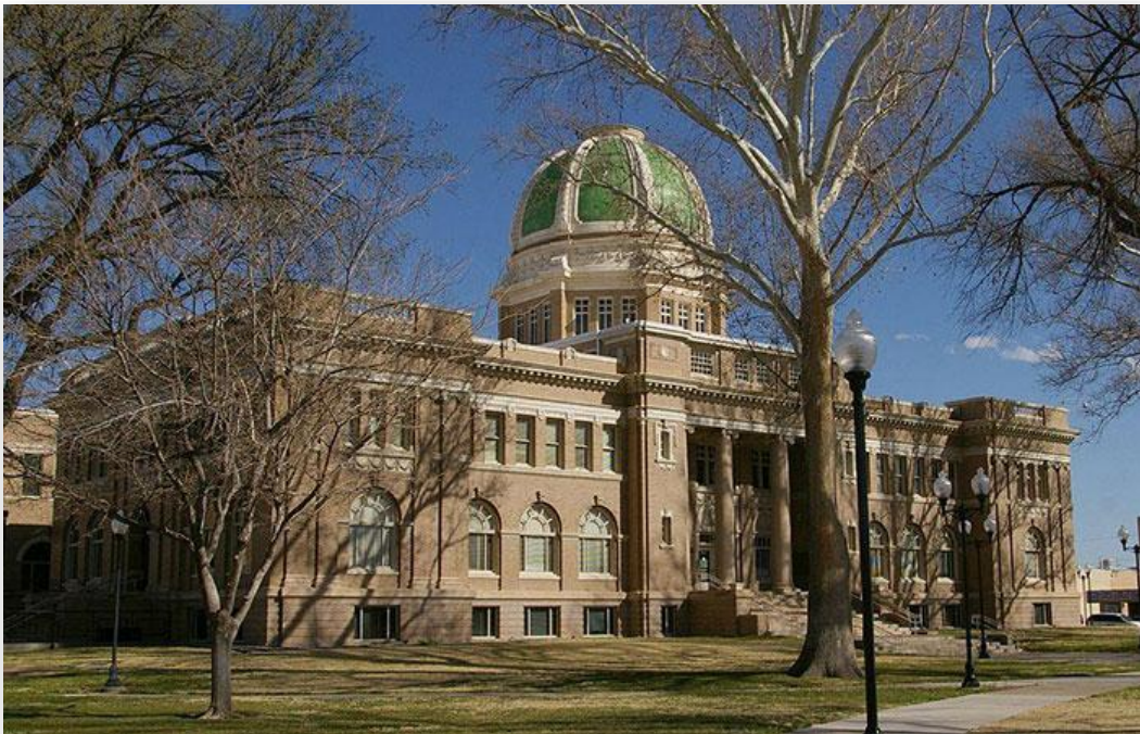
1911, Chavez County Courthouse, Roswell

Neoclassical Revival, popular SW 1895-1925