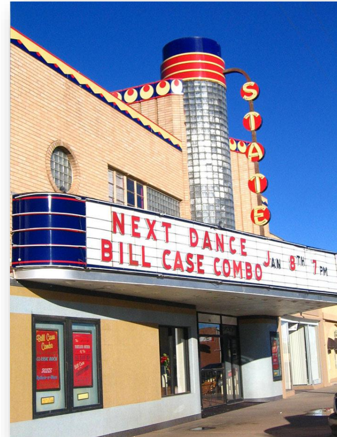
1940, State Theater, Clovis