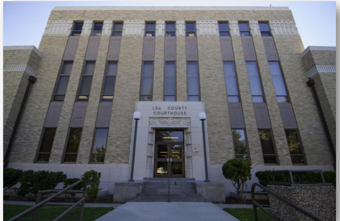
1937, Lea County Courthouse, Lovington