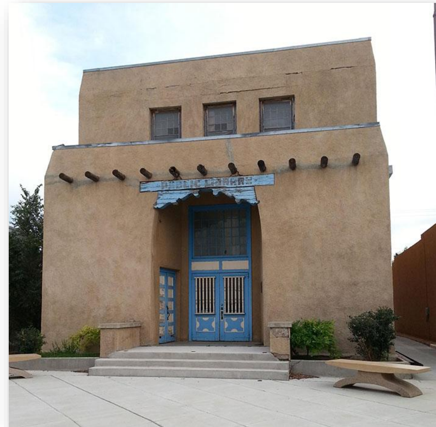
1939, Public Library (WPA), Clayton