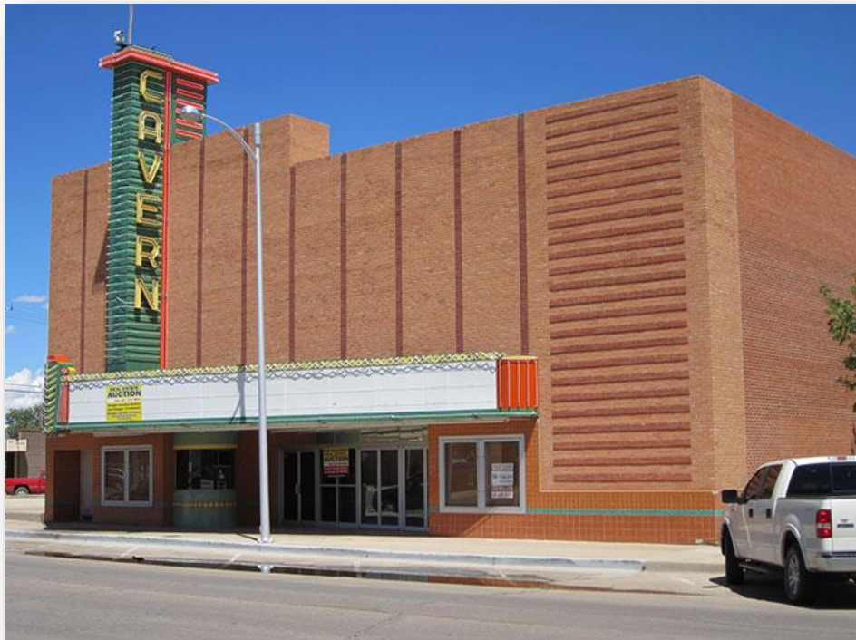
1951, Cavern Theater, Carlsbad