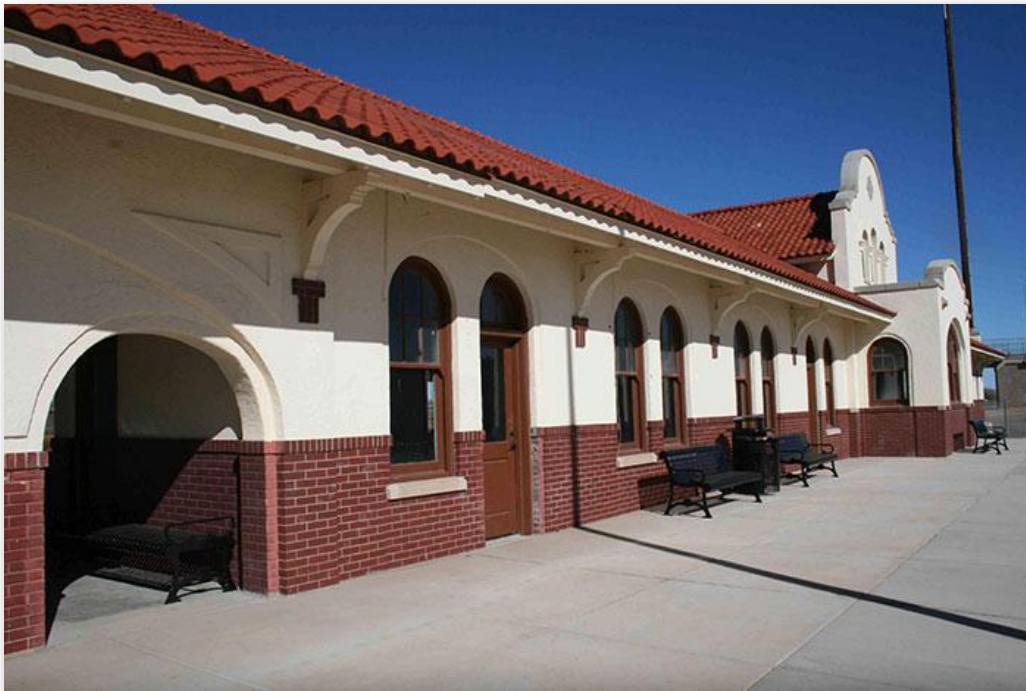
1906, Train Depot, Tucumcari