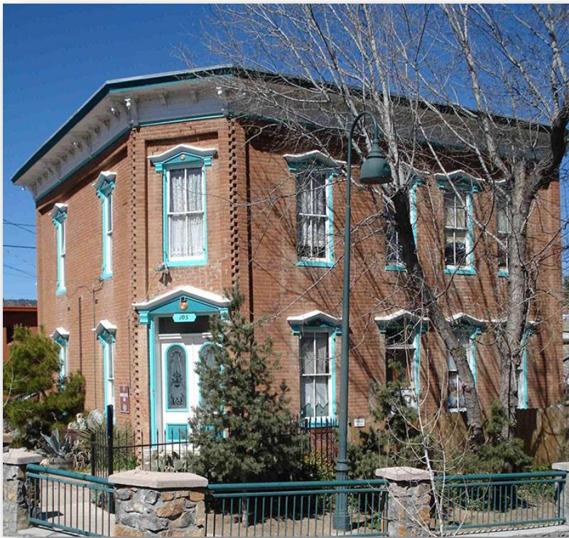
Late 1800s, Silver City Historic District, Silver City