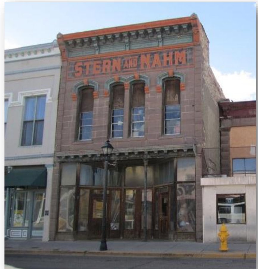
1880-90, Bridge St. Historic District Las Vegas