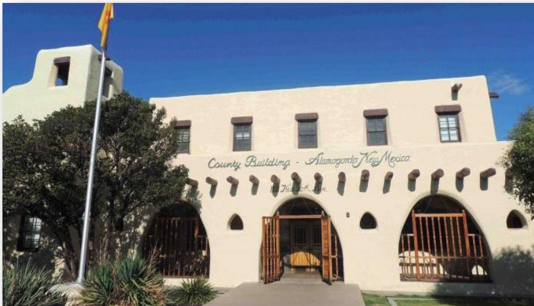
1938, Otero County Admin. Building, Alamogordo

Spanish-Pueblo Revival, 1900-40 (Phase I), 1920-present (Phase II), 1960-90 (Phase III)