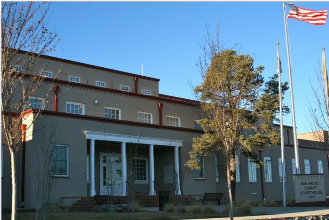
1940, San Miguel County Courthouse, Las Vegas