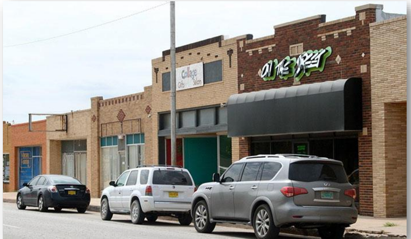
1930s, Lovington Historic District, Lovington