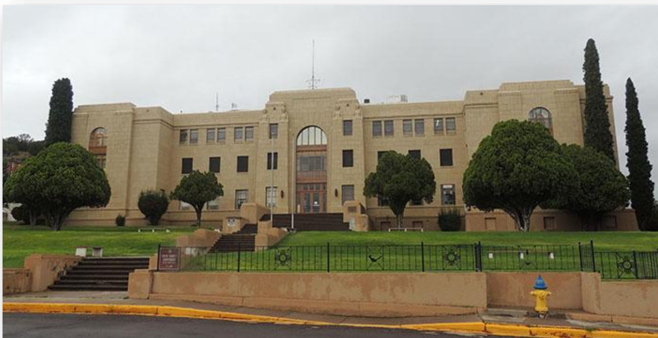
1930, Grant County Courthouse, Silver City