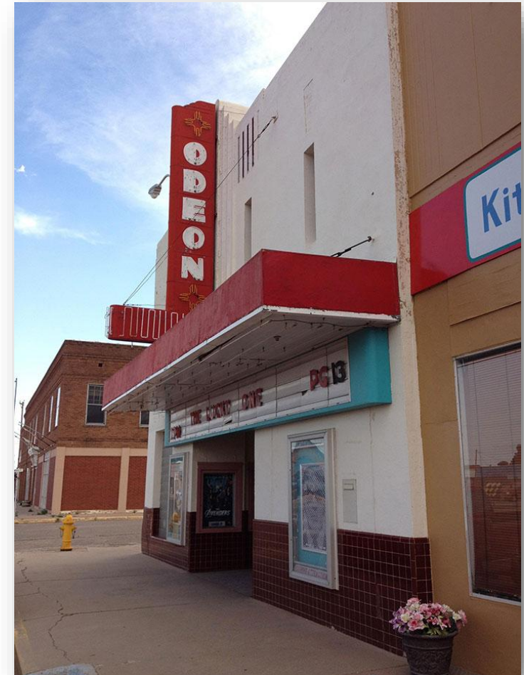
1935, Odeon Theater, Tucumcari