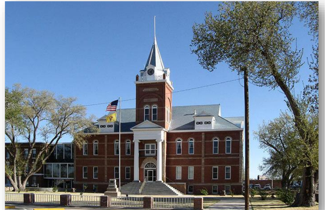
1910, Luna County Courthouse, Deming