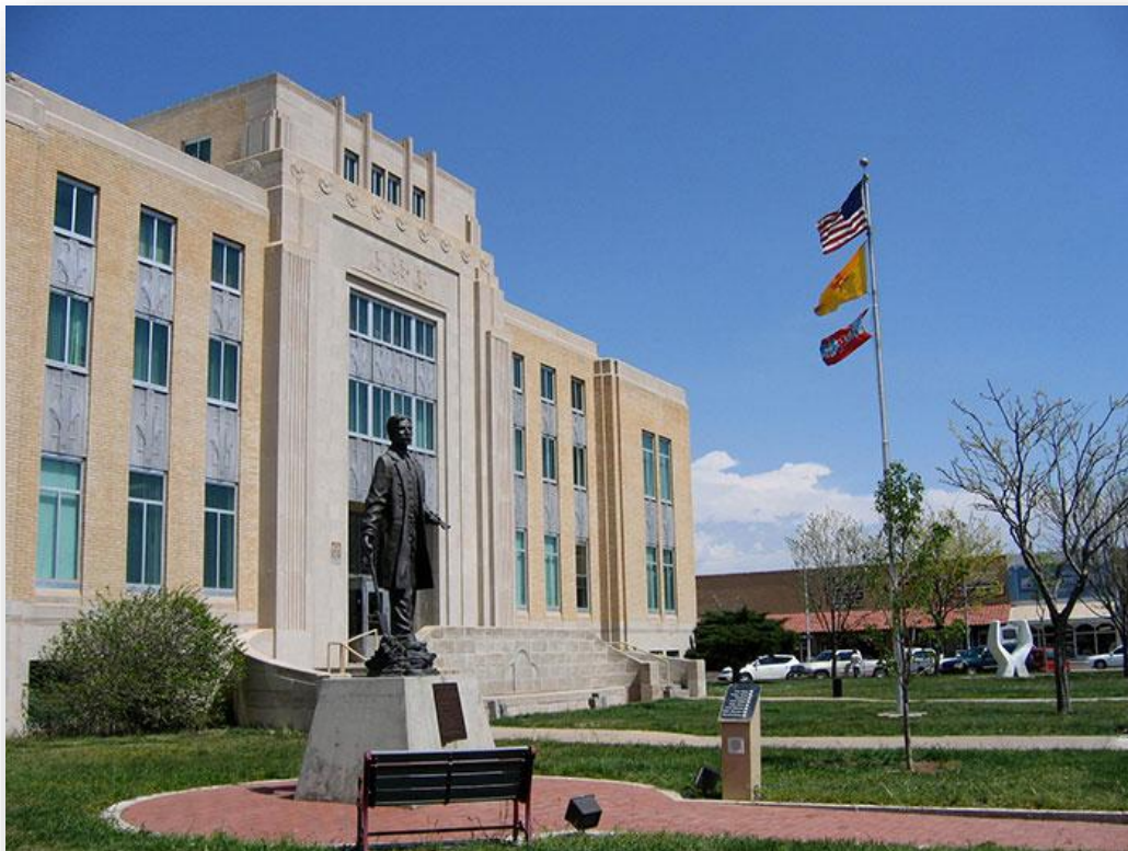
1938, Roosevelt County Courthouse, Portales