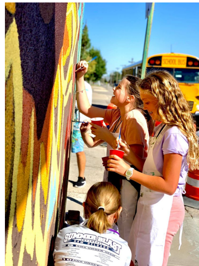
Photo: Students from Artesia Public Schools complete sunflowers during a class field trip.

I'm very proud of our Downtown Mural Program , our first project post-pandemic. We began in the Summer of 2021 and have already completed 4 murals with another one anticipated this summer. The program has been made possible through multiple funding sources. It's brought community members together, and invites visitors to stop and explore the Downtown corridor.