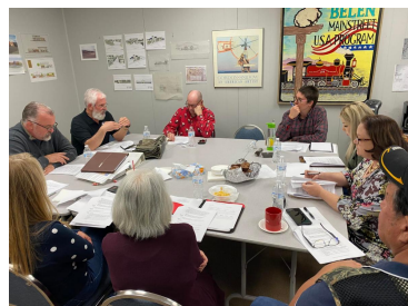
Belen MainStreet Partnership's Board held a workshop to plan exciting projects in their downtown.