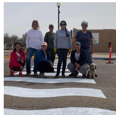
Santa Rosa MainStreet's