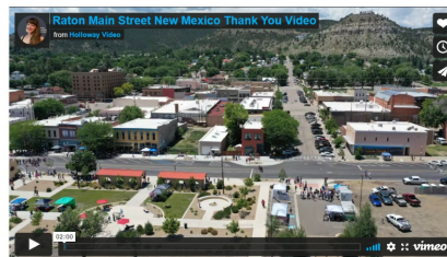
Raton Main Street New Mexico Thank You

Learn more about this catalytic project and watch Raton's heartwarming tribute on our website .