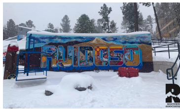
Ruidoso Midtown Association